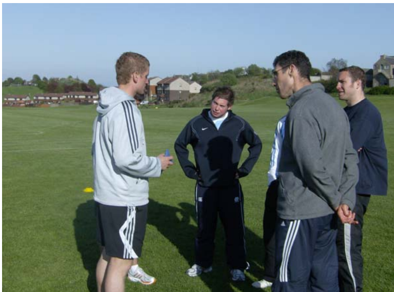
Teachers from Fife secondary schools taking the Certificate in Teaching Secondary Athletics at Beath High School

In association with this Continuous Professional Development (CPD) sessions are available from the governing body, and can be delivered by SportTayside & Fife . At both primary and secondary level teachers can chose to do a two or three hour workshop session or a six hour Certificate in Teaching Primary/Secondary Athletics (this can be delivered as one session or across two or three sessions, as appropriate).