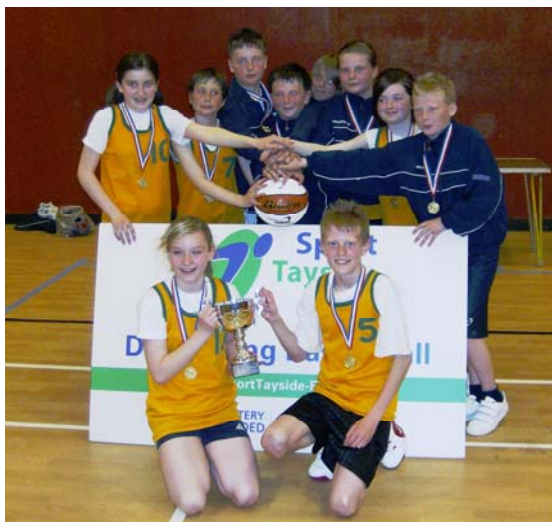
The triumphant basketball team from Inverbrothock Primary School, Arbroath, who won their first Tayside & Fife title.

Inverbrothock won all their games, with Whitehills coming second. Dens Road defeated Mill O'Mains to secure third place. The standard of play was excellent, with many players going on to be picked for the Tayside Regional Representative team.