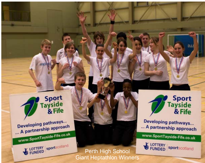
Perth High School Giant Heptathlon Winners

Following the success of the Perth & Kinross Giant Heptathlon in November, Angus and Dundee held their events in early February. Angus held two half-day competition events, one for S1 pupils and one for S2 pupils. Both events were won by Monifieth High School and were well received by staff and pupils alike. The Dundee event followed the full day format with S1 and S2 pupils combining to receive training in each of the seven events and relays in the morning session and then a competition in the afternoon. Once again the event was very well received and saw the pupils involved in vigorous physical activity all day long. On this occasion Grove Academy came out on top.